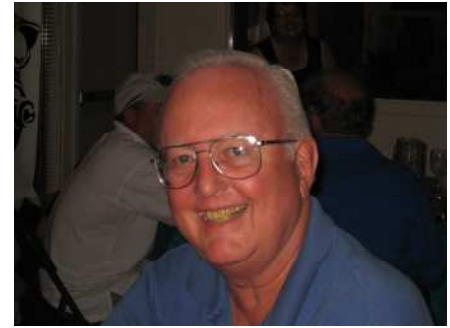
Some of the Pittsburg Clan